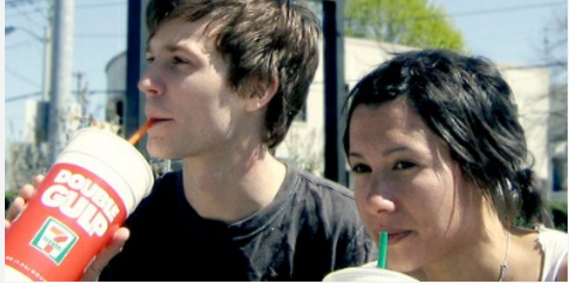
Matt and Kim

90-degree beach weather, Nathan's hot dogs and free music all factor into a day that I've looked forward to for years. It's not the 4th of July. This day comes two weeks later. The stage that's previously hosted indie rock legends like Broken Social Scene in 2008 and Built to Spill in 2009 will be sporting sunny indie-poppers Matt and Kim and neo-punks Ted Leo and the Pharmacists.